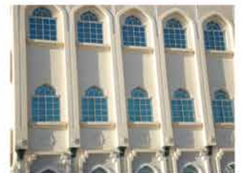
Project Time: 2003 – 2004 Project Value: R.O. 550,000.000