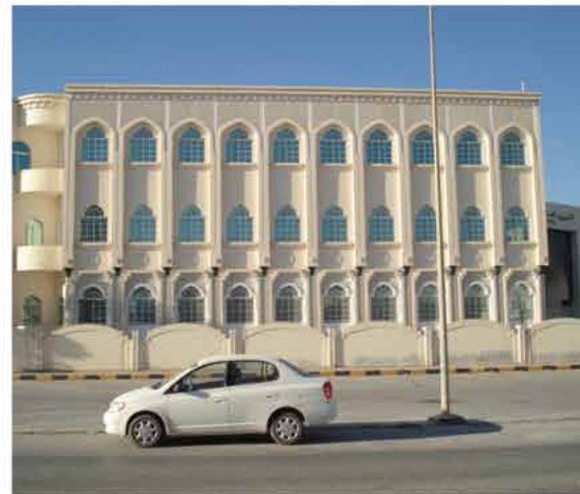
Construction of D.G Of Electricity, Salalah Client: Ministry Of Housing, Electricity & Water