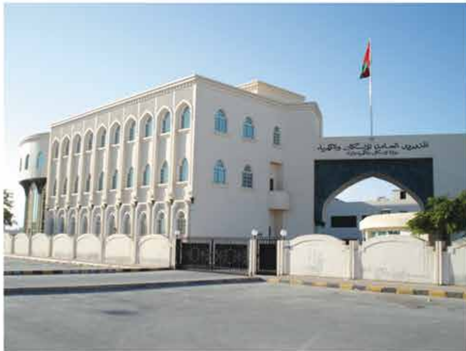
D.G. OF ELECTRICITY BUILDING - SALALAH